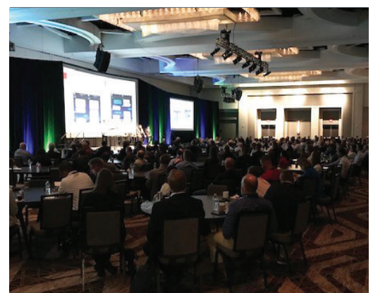
More than 450 industry experts, academics, and professionals from 18 countries attended this year's CII Annual Conference in San Antonio to learn, discuss, present, and network with peers. Special topics included safety, energy trends, decarbonization, and economic outlook.