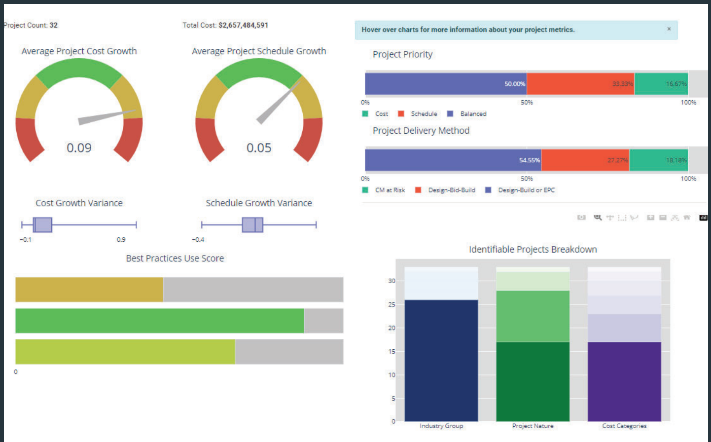
Data Warehouse Dashboard Sample

Participating companies that utilize the CII Data Warehouse regard it as a benchmarking and performance assessment tool to support streamlined data analysis, informed decision-making, and enhanced collaboration. Federal Facilities participants noted that the Data Warehouse enabled a data-activated culture that enhanced their capacity for mission success. CII invites all members to get involved by designating personnel to attend a virtual Benchmarking Associates Training event and staying engaged by joining the Data Analytics Community for Business Advancement.