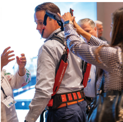
Attendees try on the new Hilti Exoskeleton designed to help relieve shoulder and neck fatigue when working above shoulder level.

With a fresh focus on what's possible, this year's CII Innovation Showcase at our Annual Conference featured dynamic new technologies in thought-provoking demonstrations, experimental solutions, and collaborative approaches to solving problems.