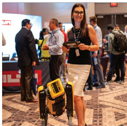
To improve safety and productivity a CII member demonstrates a robotic dog that can handle labor-intensive tasks such as progress scans, as-built analysis, and quality checks for improving safety and productivity.