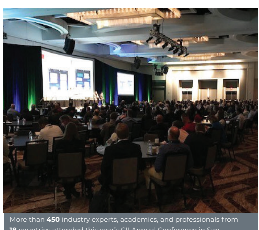
More than 450 industry experts, academics, and professionals fror 18 countries attended this year's CII Annual Conference in San Antonio to learn, discuss, present, and network with peers. Special topics included safety, energy trends, decarbonization, and economoutlook.